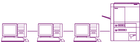
CLC900 + PS-MX20E